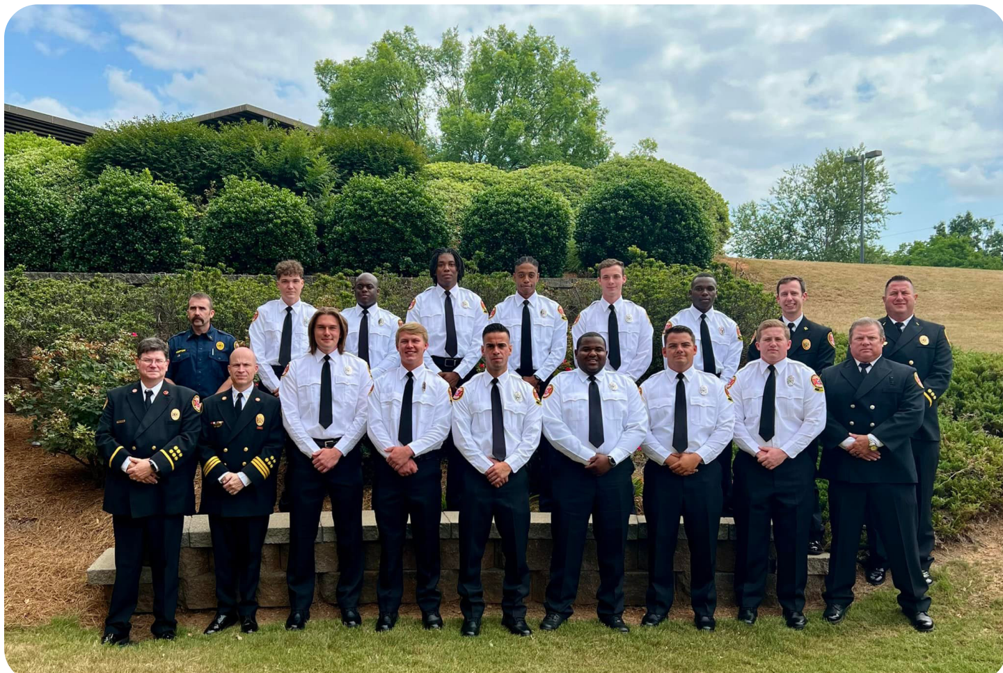
On June 24, class 21-02 graduated from the Fire Academy